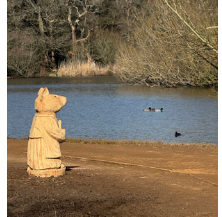
Brambly Hedge Trail & Gloucester Ride

There are lots of fantastic events planned for the coming weeks including our VE Day 80 th (1945-2025) Community Get-Together hosted with the 10 th Chingford Scouts on Bank Holiday Monday 26 th May (details overleaf) and our Community Litter Pick on 11 th May - and of course our regular groups continue including our bi-weekly Wednesday Walks and Friday Club . You can find the key dates and details of these and more local activities below, as well as on our Instagram , Facebook page , or our newly updated and active website : www.dadra.org.uk